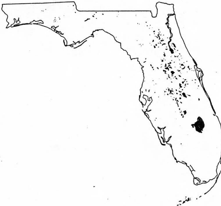
Figure 2. Distribution of Florida lakes (after Brenner et al. 1990).

Florida has an amazing abundance and diversity of lakes, reflecting the state's differences in surface features, geology, and hydrology. The more than 7,700 lakes of Florida have an uneven spatial distribution (Figure 2), with more than half occurring in the central upland portion of the peninsula. Approximately 35 percent of the lakes are located in the four central Florida counties of Lake, Orange, Polk, and Osceola (Palmer 1984).